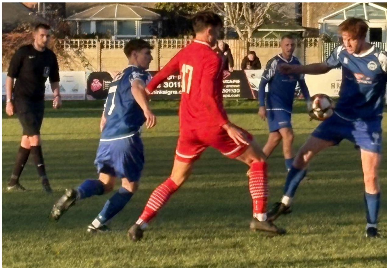
Action today from Victoria Park where visitors Portland United (blue) hit three without reply against Bournemouth