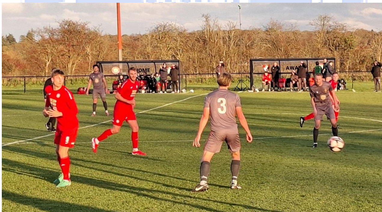
A game of two halves at Ringwood (red). Leaders Fleetlands were behind at the break but totally dominated the second half, but they left it late to snatch victory.