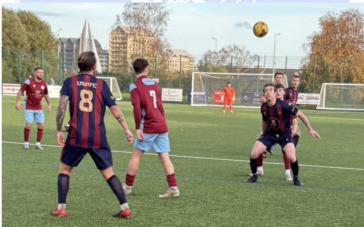
Action this afternoon from Hamworthy United (claret) where visitors United Services Portsmouth earned a share of the spoils in a 1-1 draw.