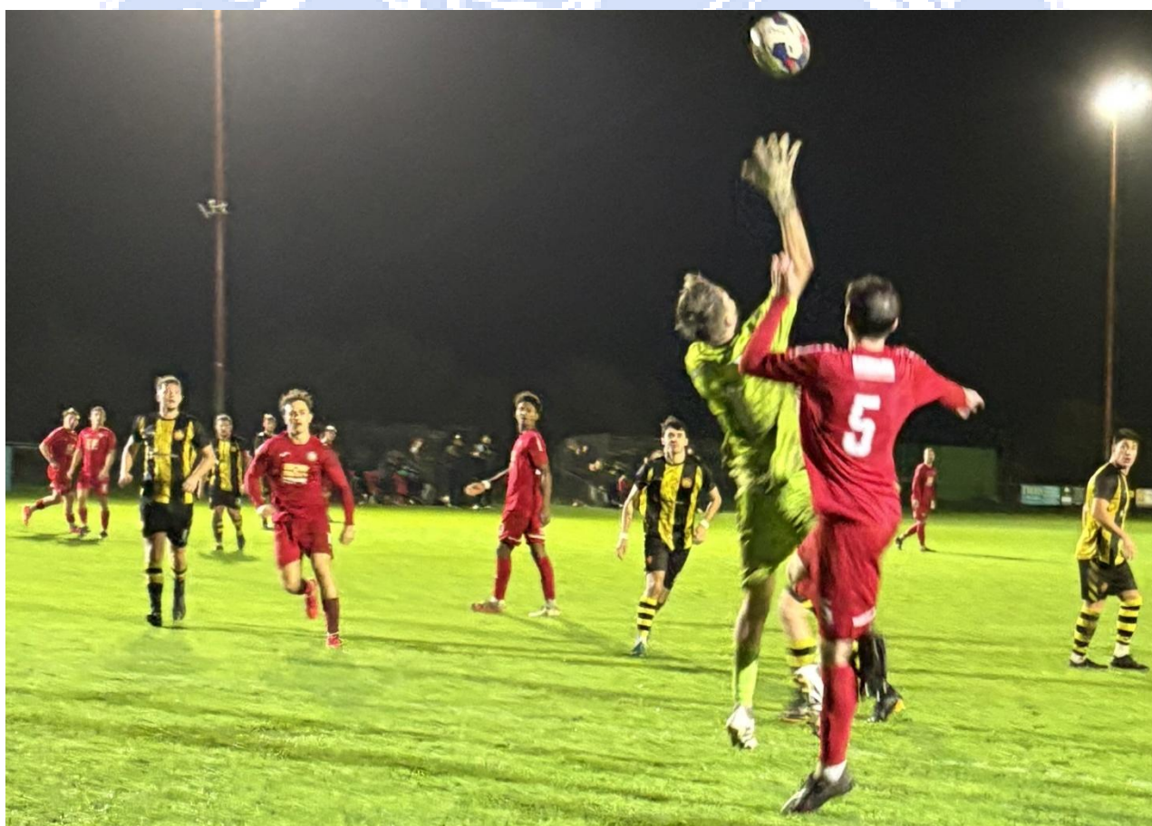
A wet and windy night at the Ringwood Hub where Ringwood Town (red) hit seven without reply against Hampshire Premier League Division One side Nursling & Shirley in the Southampton Senior Cup.