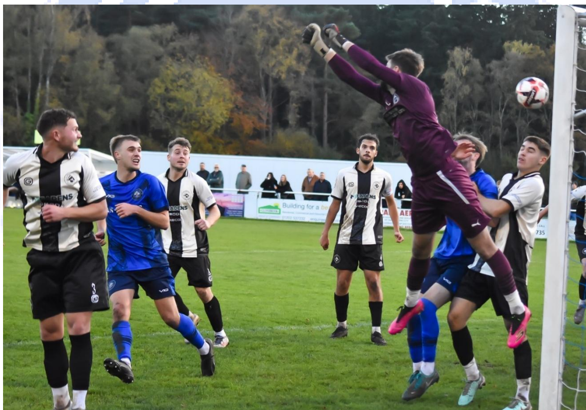
Honours even at one apiece at Hurn Bridge between Christchurch (blue) and Brockenhurst- goalmouth action here