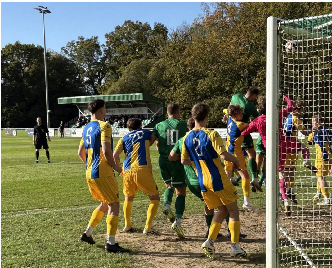
Action from Magna Road, where the hosts Hamworthy Recreation (green) hit three without reply against New Milton Town in the Premier Division.