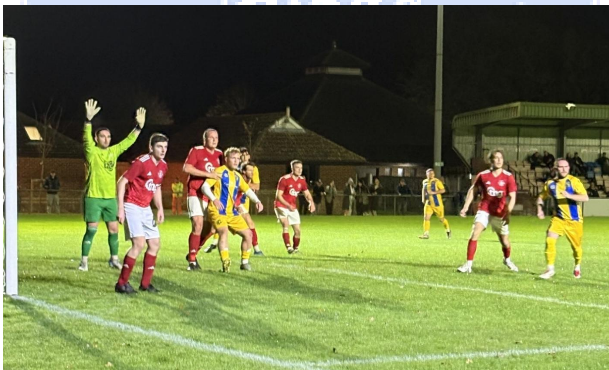
New Milton Town (yellow) hit three without reply against their Southampton League opposition Dynamo Dockside in the Southampton Senior Cup in the week at Fawcetts Field