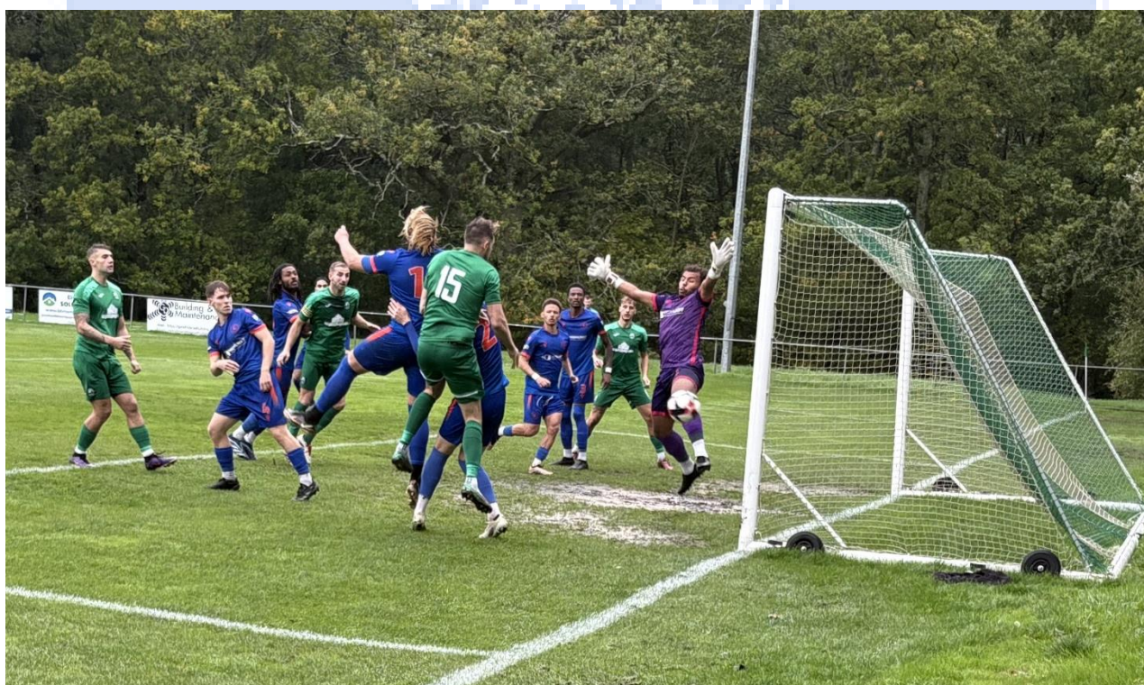
Isuzu FA Vase action this afternoon at Magna Road, where Hamworthy Recreation (green) beat Southern Combination outfit Midhurst & Easebourne 3-1, after going a goal down inside the first five minutes.