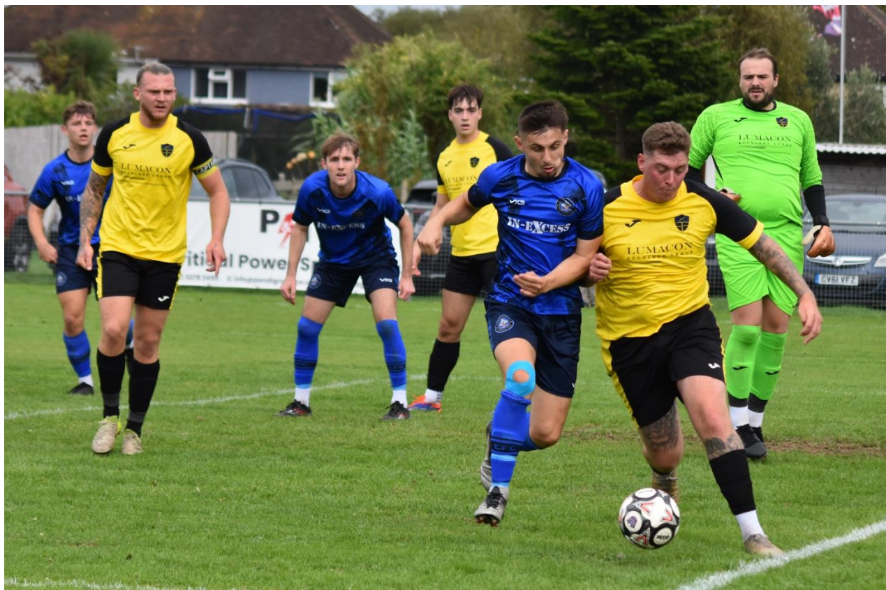
Action from Sidlesham this afternoon. Infinity (yellow) took on Christchurch in the Isuzu FA Vase where it ended one apiece. The former Wessex members went on to win 4-3 on penalties.