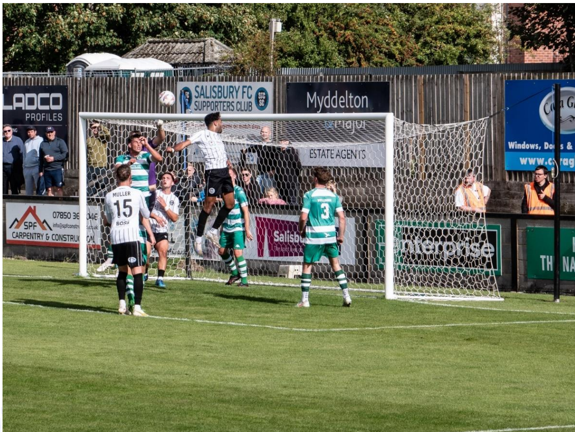
No cup upset here, as Salisbury (white) saw off neighbours Laverstock & Ford 4-1 in the Emirates FA Cup Second Round Qualifying this afternoon.