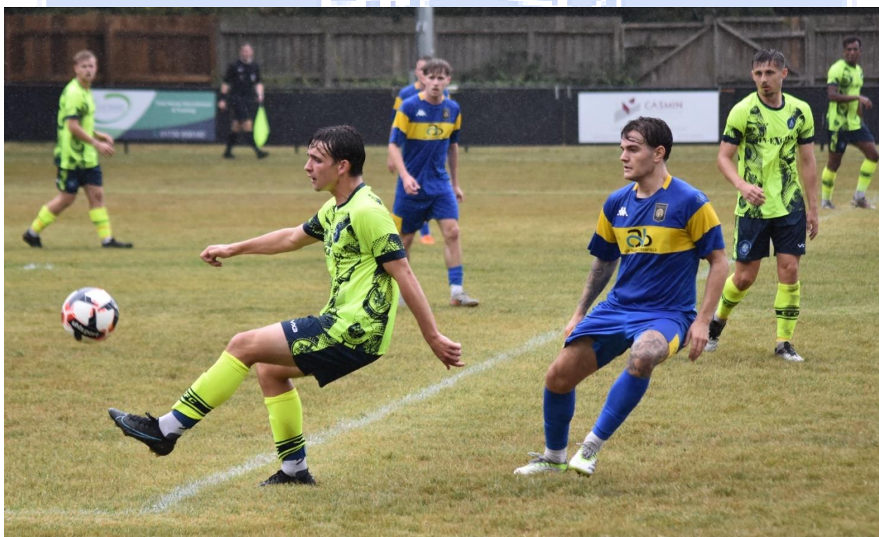
Action from Love Lane, where Petersfield Town (blue) lost their 100% winning start to the term at the hands of Christchurch, 3-1 who retained theirs!