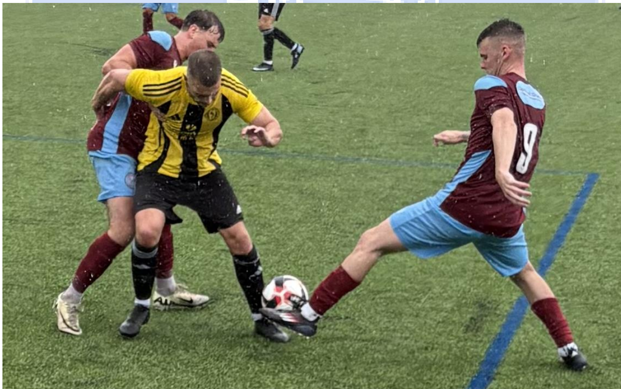
Six goals and the points shared at the County Ground as hosts Hamworthy United (claret) came from 3-0 down to share the spoils against new boys Colden Common in conditions akin to late October not August.