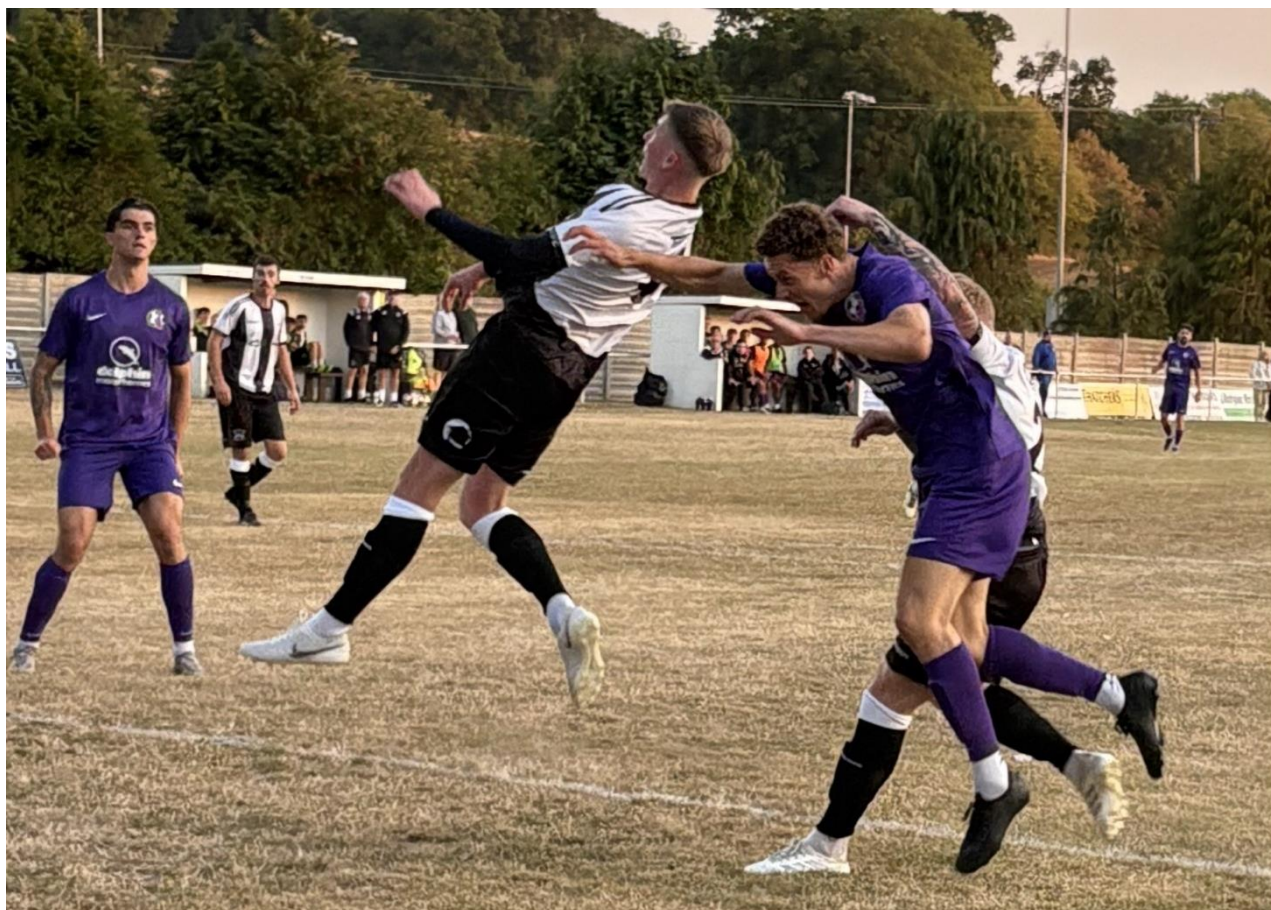
Sherborne Town (black and white) were home in midweek and held on for the three points against AFC Stoneham- weathering the storm of the last ten minutes to claim a 2-1 victory,