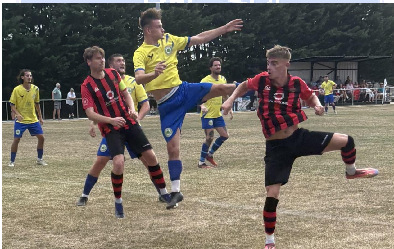
A two hour trip south and west for Ash United (yellow) ended in penalty shoot out defeat at the hands of Sturminster Newton United today in the Isuzu FA Vase. Game ended one apiece with the Cherries progressing 5-4.