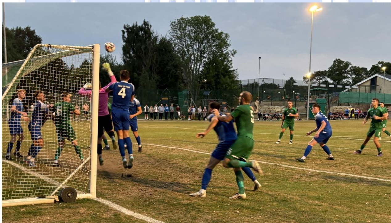
Midweek action from Magna Road where Hamworthy Recreation (green) won by the odd goal of three against Portland United who had perhaps justifiable shouts for a share of the points ruled out at the death.