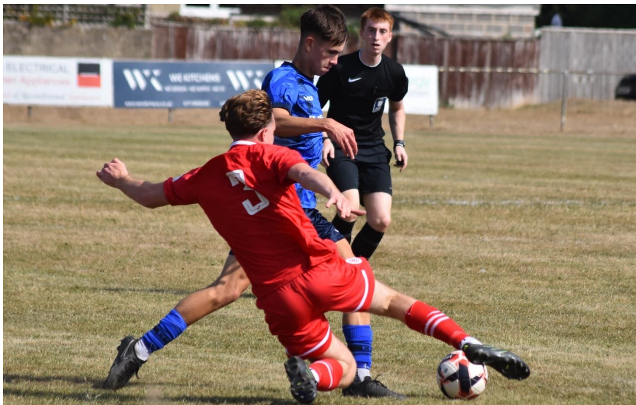
Premier Division action from Victoria Park, where visitors Christchurch (blue) edged the three points against Bournemouth in a game that ended 2-3.