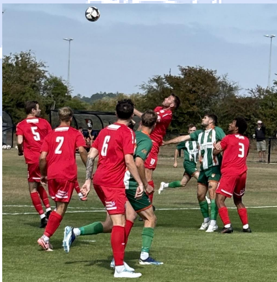
Despite the sun it was a windy Long Lane this afternoon for the visit of Yateley United (green and white) in a Division One clash against Ringwood Town. The hosts ran out as 5-1 winners.