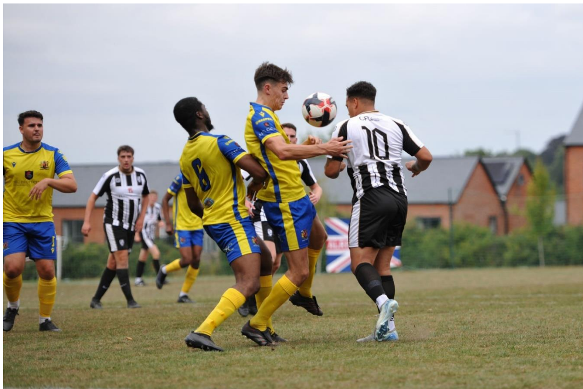
Romsey Town (yellow) hit three without reply at Alresford Town this afternoon in a Division One clash.