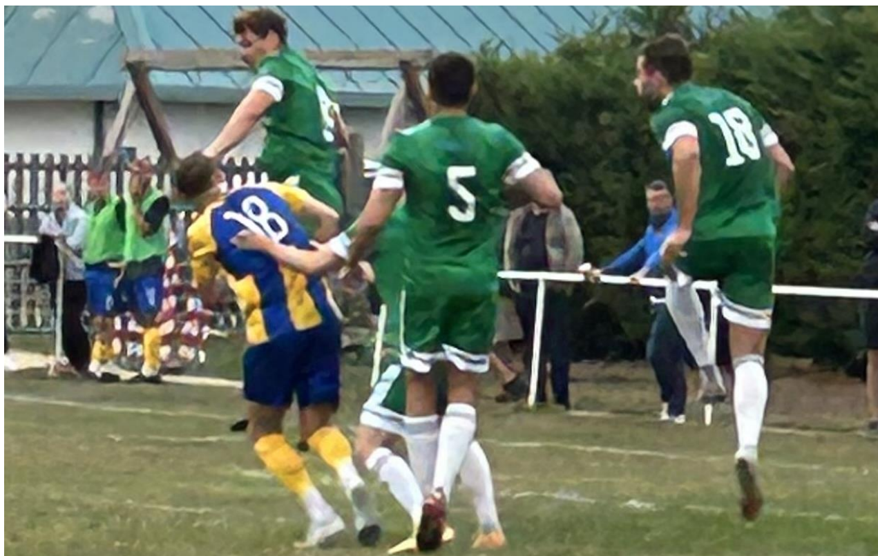
Wednesday night was again Hampshire Servio Senior Cuo action. Due to floodlight issues at the home of the Brickmakers, the tie was played at Verwood Town. The "visitors" Hythe & Dibden (green) progressed 3-2 although New Milton nearly got a shout at a penalty shootout having trailed 3-0 with 40 minutes left.