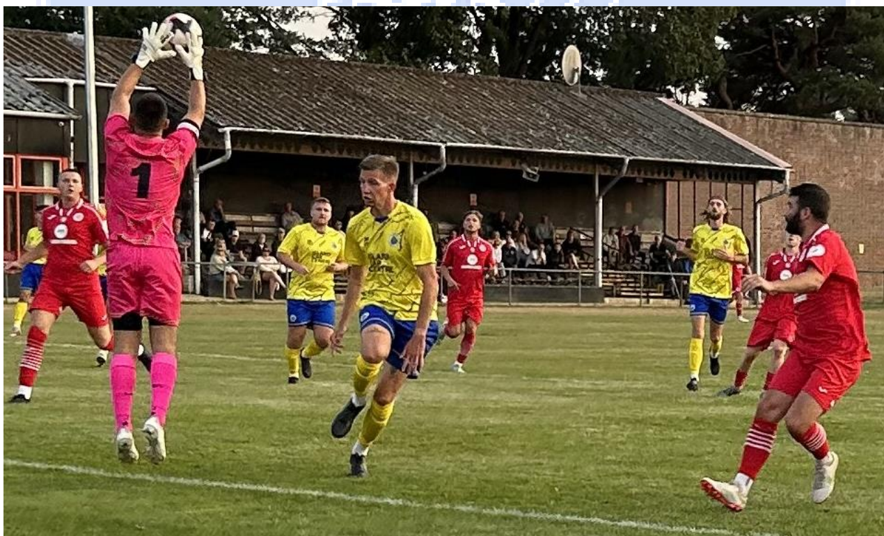
Midweek action from the Servio Hampshire Senior Cup. Bournemouth (red) were best of three winners on a warm evening at Victoria Park against Newport IOW.