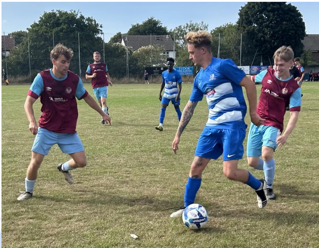
A humid afternoon today at Broadway Lane (above), where Dorset Premier League outfit Bournemouth Electric (blue) played Division One side Folland Sports. It ended honours even at one each