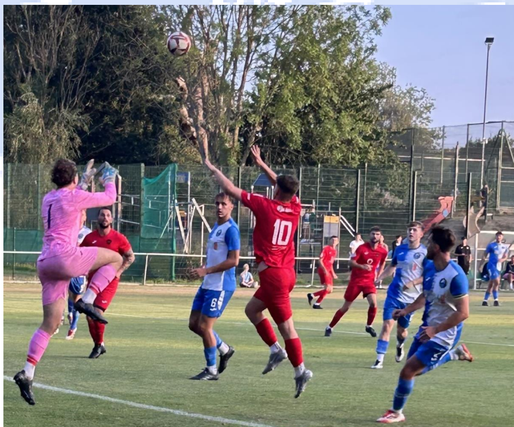
Friday night action from Magna Road, where Western League Sturminster Newton United (red) provided Hamworthy Recreation with a stern test. The Cherries edged the contest winning by the odd goal of three after the hosts had taken an early lead.