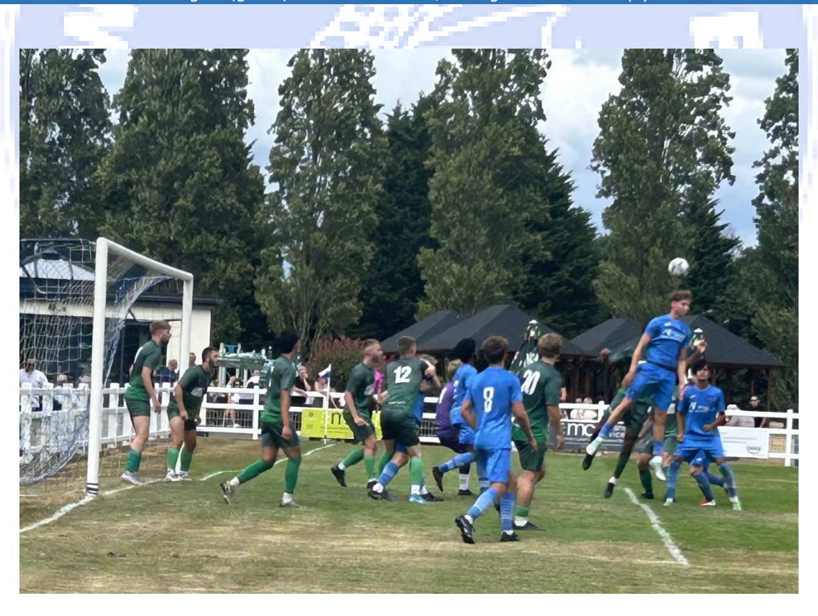
Today Cobham Sports (blue) welcomed Blackfield & Langley to their Merley Park home. The hosts hit four without reply on a very humid afternoon. The Dorset Premier League outfit added a perimeter fence around Easter and with other plans in the pipeline look to be pushing towards promotion.

Saturday, 19 July 2025 The Wessex Post Page 15 of 16