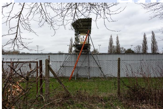
Rear of the main stand, with TV gantry

A small piece of cup giant-killing for Locks Heath then, but in the semi-final, they come up against eventual cup winners, AFC Portchester, where they do well to restrict the eventual Wessex League champions to a 2-1 victory. Romsey go on to finish 15th in Wessex Division 1, whilst Locks Heath are third in the Hampshire League, behind Liss Athletic and champions Colden Common, who will of course face Romsey this coming season following their promotion to the Wessex.