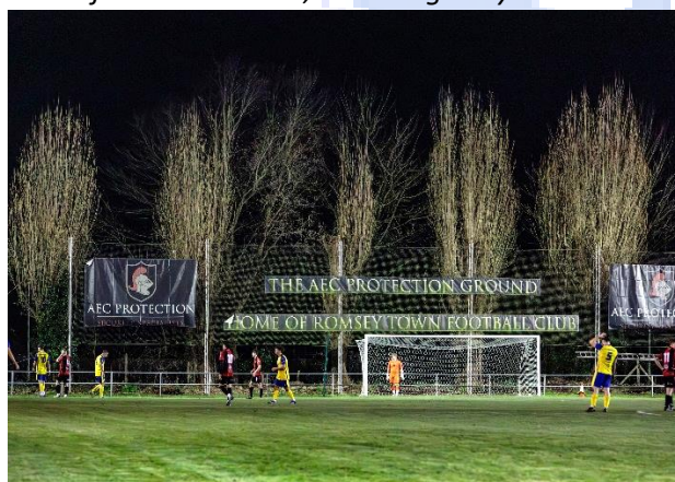
Keepnet and sponsor's signs