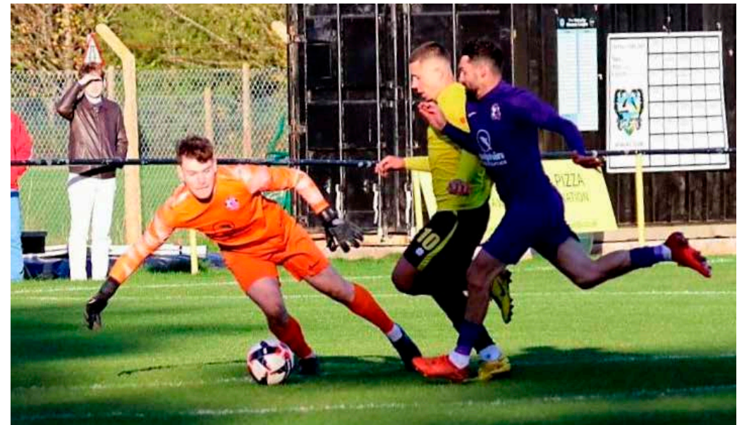
HAMBLE AND STONEHAM BATTLE IT OUT EARLIER THIS SEASON.