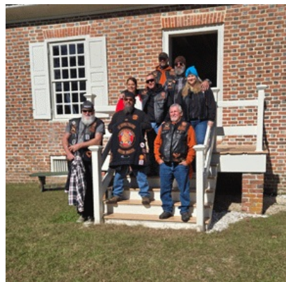
Visitors from Deal Island