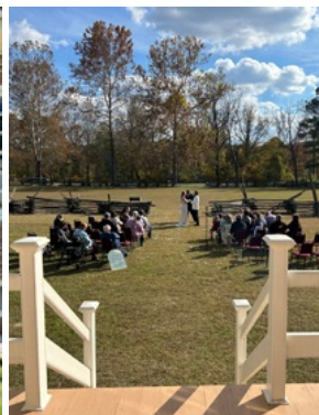
A lovely fall wedding at Pemberton