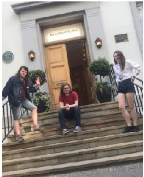
The Swamp Dogs at Abbey Road after recording 2 songs