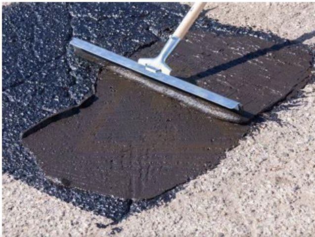
Potholes - Roads asphalts repairs in all Provinces