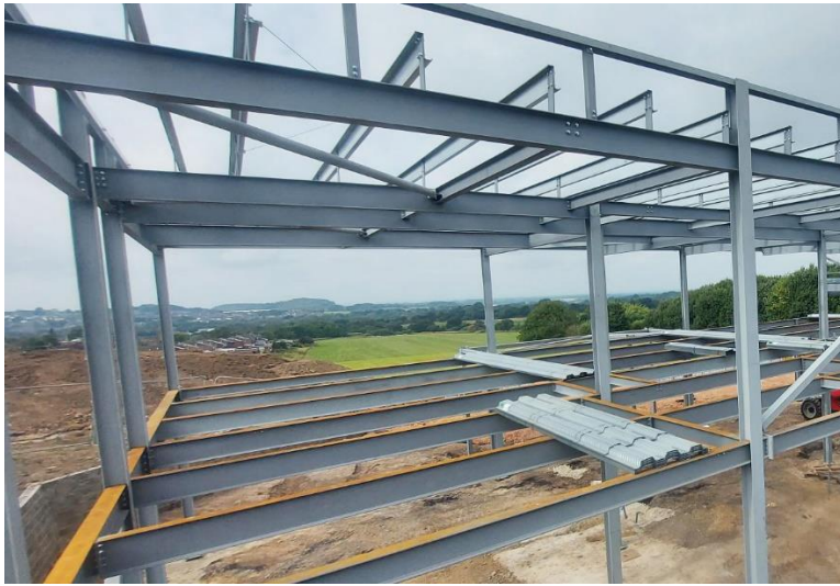
Steel Fabrication Project -Mpumalanga