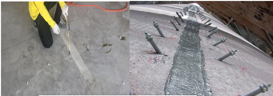
CRACK INJECTION SYSTEMS PROJECT