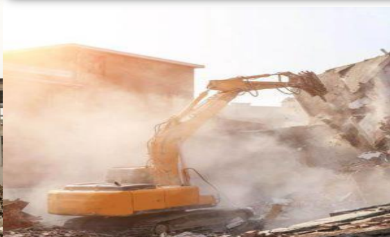
DEMOLITIONS IN PROGRESS