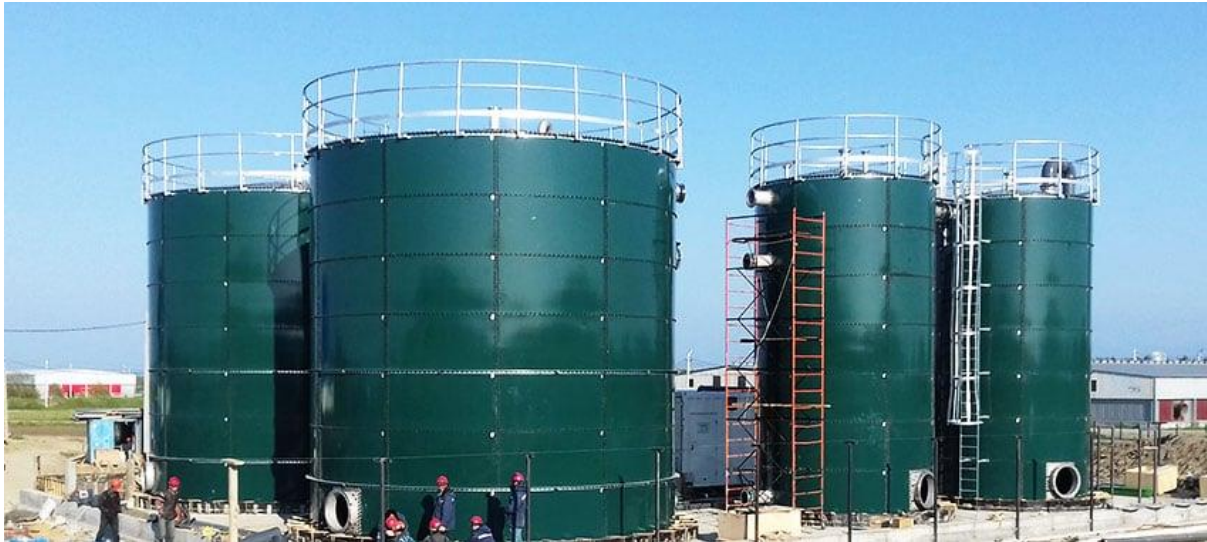
COATING OF TANKS IN PEPSICO