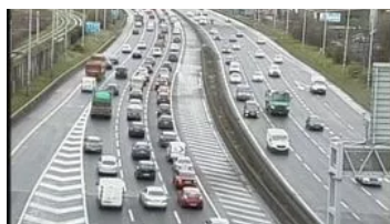
Dublin traffic LIVE: Delays growing