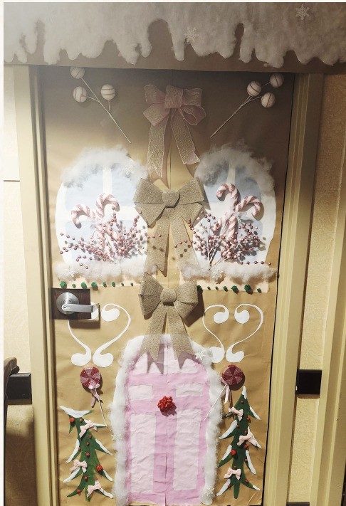
Staff's Decorated Doors