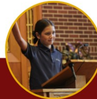
KINDERGARTEN- 8TH GRADE