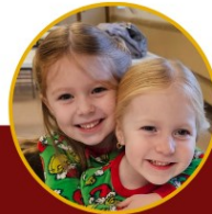
PRE-SCHOOL 3 & 4