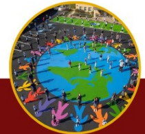
BEFORE & AFTER SCHOOL PROGRAM

VISIT US AT: stteresaschool.org OR 856-939-0333 adestteresaschool.org