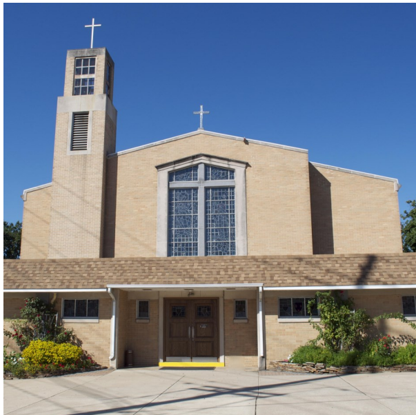
St. Teresa of the Infant Jesus Church 13 E. Evesham Road

“Two beautiful churches, one GREAT parish.”