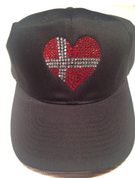
Black baseball cap with heart logo in sequins $20.00