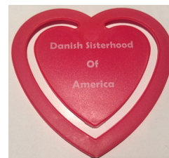
Red plastic heart-shaped paper clip $1.00