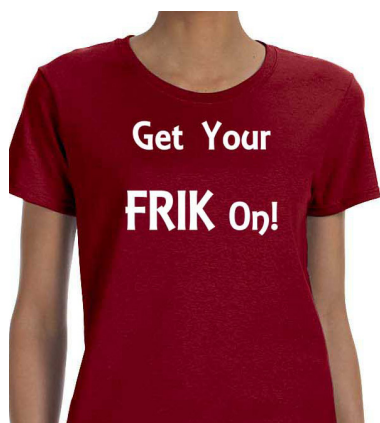
Frik T- Shirt Red with white print (Front and Back Shown) M, L, XL, XXL $20