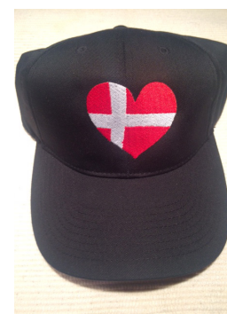
Black baseball cap with heart logo in satin stitch embroidery $20.00