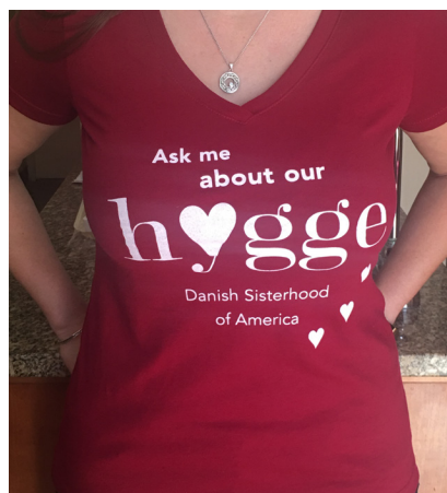
Hygge T- Shirt Red with white print M, L, XL, XXL $20

Contact Linda Holz for shipping and handling charges.