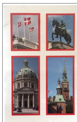
Greeting Cards blank inside, $1.00 each