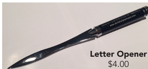
Letter Opener $4.00