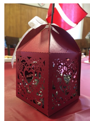
Laser cut boxes (unassembled) for table favors $ 0.75