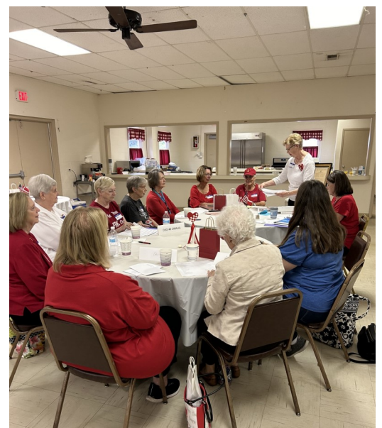
PHOTO LEFT: Danish dinner. PHOTO MIDDLE: Auction baskets. PHOTO RIGHT: Business meeting.