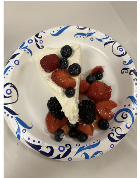
PHOTO ABOVE: Forgotten Cake was the special dessert served at the 2024 Nebraska Convention.