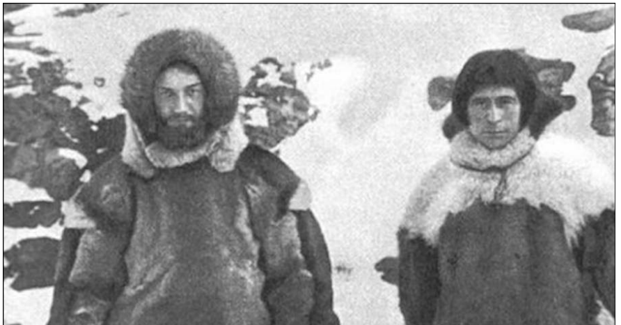
PHOTO ABOVE: Peter Freuchen with an Inuit man on one of the Thule expeditions.