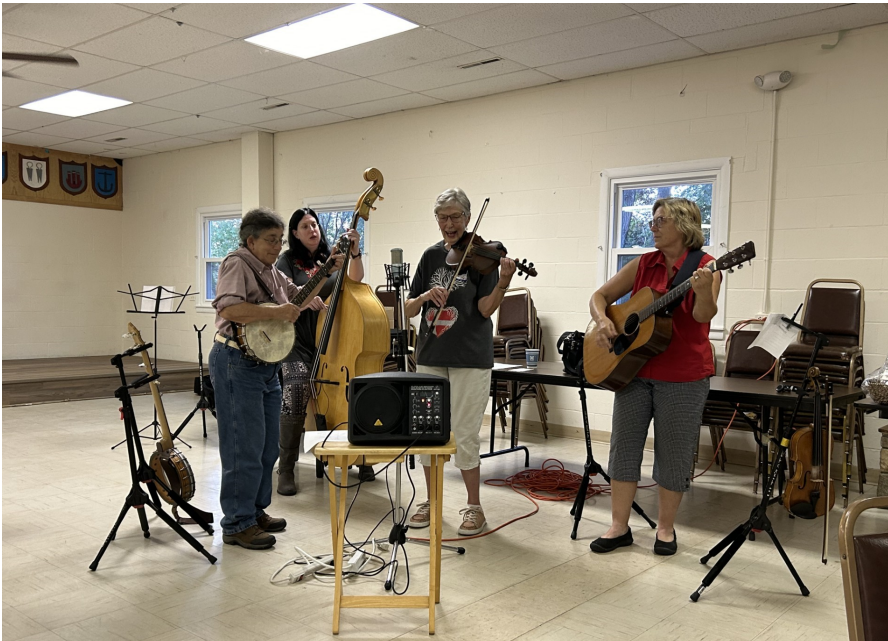
PHOTO ABOVE: The Flatwater Drifters play their music for an excited audience at the 2024 Nebraska Convention.