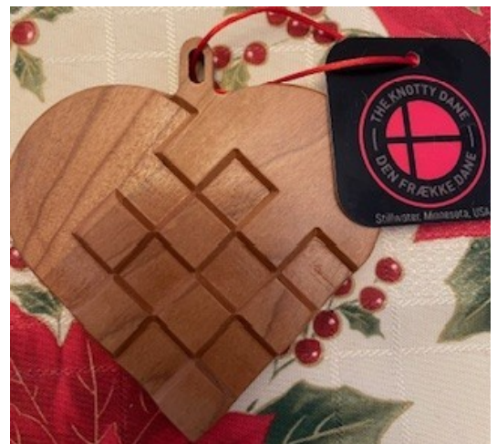
PHOTO ABOVE: Wooden Danish heart basket ornament by The Knotty Dane given to Lodge 15 members as a thank you.

We look forward to another great year of meetings, lodge events and wonderful programs with Dronning Margrethe Lodge #15. We are Red. We are White. We really are Danish Dynamite!