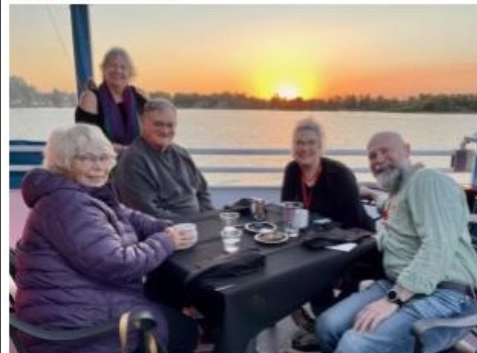
Gull Lake Cruise