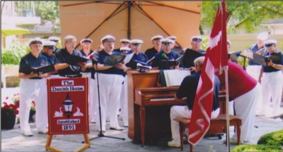
PHOTO ABOVE: Bjornson Male Chorus of Chicago at Summerfest 2012 at the Danish Home in Chicago.