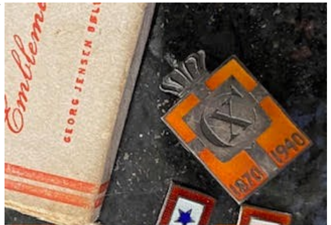
PHOTO ABOVE: The pin and box are pictured here. Beside it are the pins that were given to my Grandparents in 1943, to honor the fact that they had 6 sons in the Military during WWII. Their other twin boys were not old enough to serve yet. But they followed 2 years later.