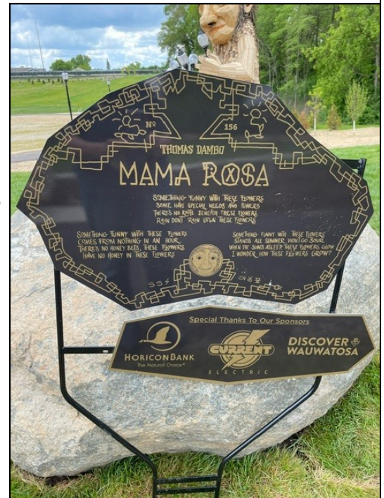
PHOTO ABOVE: Monument plaque on the trail to the Dambo troll includes Dambo's poem.