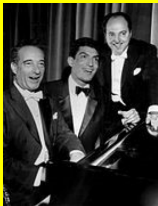
PHOTO RIGHT: Victor Borge visiting the Diaspora Museum Beit Hatfutz in 1983.