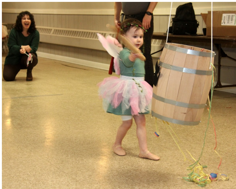
PHOTO LEFT: The littlest fairy starts off the Slå katten af tønden tradition at Fastelavn 2026.