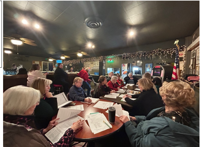
PHOTO RIGHT: While the husbands, Mr. Sisters, and DAAC members set up for Fastelavn, twenty-three Dagmar Lodge #4 Sisters voted on a slate of officers for nomination, on the theme for the Convention, and look ahead to the upcoming Winter Luncheon.