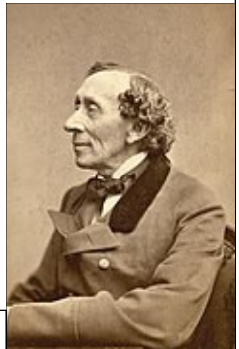
PHOTO RIGHT: A portrait of the Danish writer, Hans Christian Andersen.