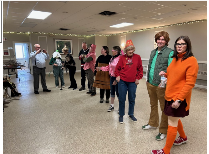
PHOTO RIGHT: Chinese New Year, Cat in the Barrel, Shaggy and Velma, 50s bobby soxer, and Hockey players were some of the adult costumes this year.