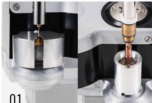
01 Functions of wire cutting and cleaning a tip body are mounted.