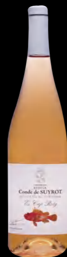
Cap Roig Cabernet Sauvignon Syrah & Mantonegro (ROSÉ)