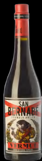
Vermouth San Bernabé