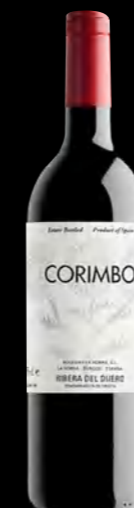
Corimbo Reserva Tinta Fina (Red)