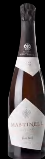
Mas Tinell Brut Real (Cava)