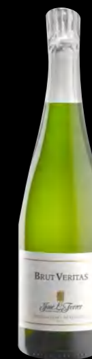
José Luis Ferrer Veritas Brut (CAVA) BINISSALEM, MALLORCA