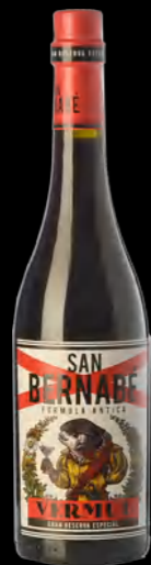
Vermouth San Bernabé