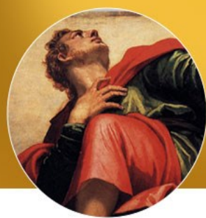
FEAST OF SAINT JOHN 12/27