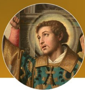
FEAST OF SAINT STEPHEN 12/26