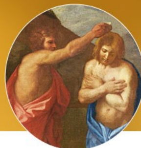
FEAST OF THE BAPTISM OF THE LORD 1/11