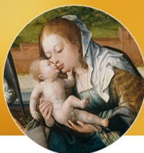
SOLEMNITY OF MARY 1/1