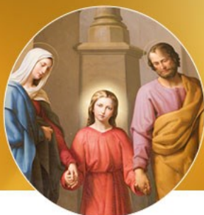
FEAST OF THE HOLY FAMILY 12/28