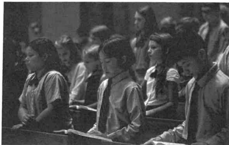
Students from Father Marquette Catholic Academy in Marquette.

Catholic schools are striving to form saints and scholars without the same resources afforded to other schools. This is why MCC and the Michigan Association of Nonpublic Schools advocate for lawmakers to include or increase funding to support all students, such as funds to ensure all schools are safe.