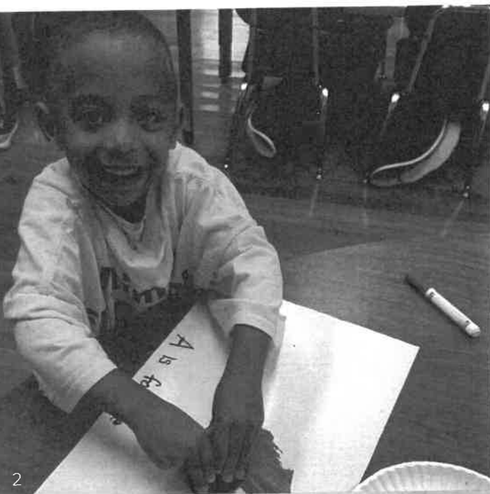
Student at St. Charles Borromeo Catholic School in Coldwater.

In addition to local parish and alumni support, diocesan-wide scholarships and financial aid demonstrate how