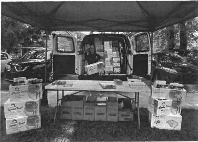
CCWM initiated a mobile diaper bank to serve rural west Michigan families in need.