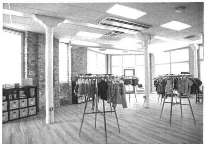
The St. Gianna's No Cost Baby Boutique, run by CCWM with locations in Grand Rapids and Muskegon, aims to empower families through compassionate care and a dignified shopping experience.