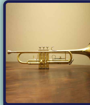
A trumpet (wind instrument)

a group of musicians playing the saxophone, trumpet and trombone in a band