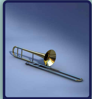
A trombone (wind instrument)