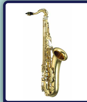
A saxophone (wind instrument)