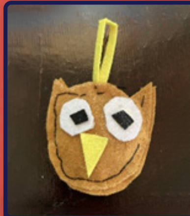
finished decoration/ key ring