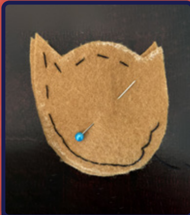
seam made with running stitch and backstitch