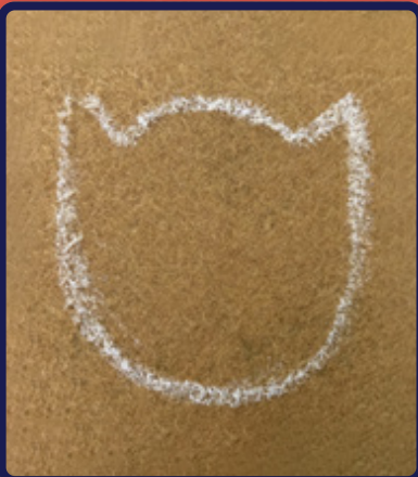
felt showing a shape marked with chalk

these stitches can be used for joining fabric together to create a seam