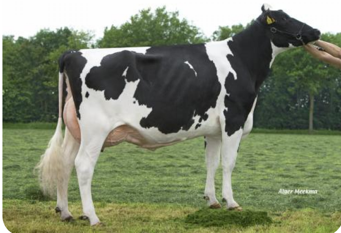
JIMM Holstein Hellen 592 (VG 88) (half sister of FaWi Mr. White)