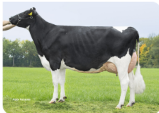
Grashoek Vrije Tulp 81 (VG 87) (v. Slash) Owner: Fok- en melkveebedrijf K.I. SAMEN, Grashoek