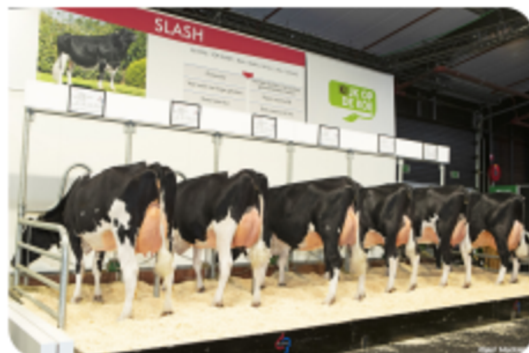
Daughter group VDR Slash RMV Hardenberg 2021