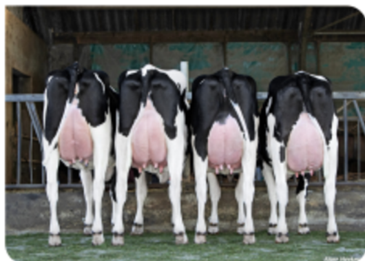
Leida 777, Leida 769, Fennie 287 & Leida 77 (s. Slash) Owner: V.O.F. Miskotte, Den Ham (NL)