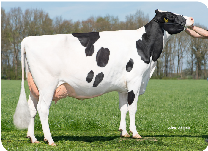
Corrie 155 (s. Kratos)