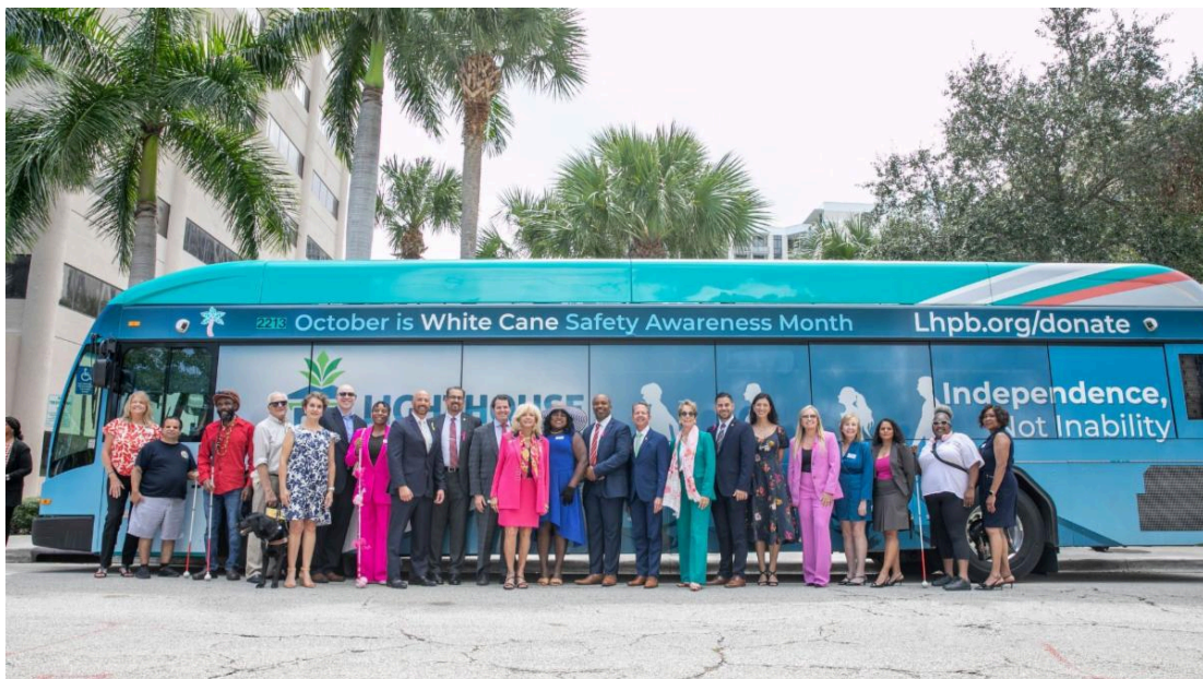
White Cane Safety Day at Tutto Fresco

Thank you all for coming to the launch event of the Lighthouse Bus this past month as well as all of the wonderful comments from people that saw the vehicle! We appreciate Palm Tran's collaboration on this!