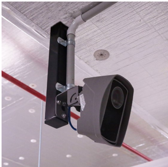
Our range of Licence Plate Recognition cameras can be positioned suit all applications from free stand outdoor to ceiling mounted under cover.