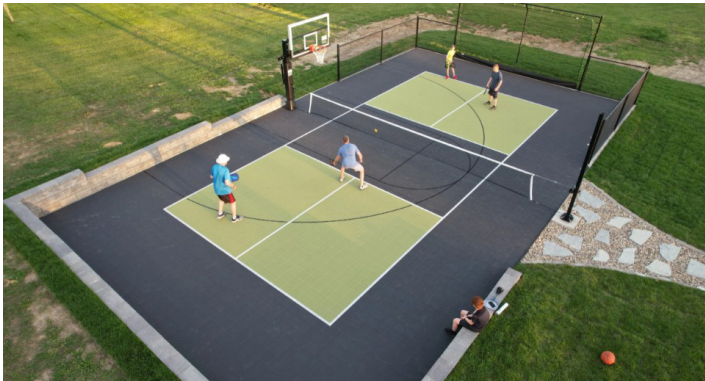
MULTI SPORTS COURT