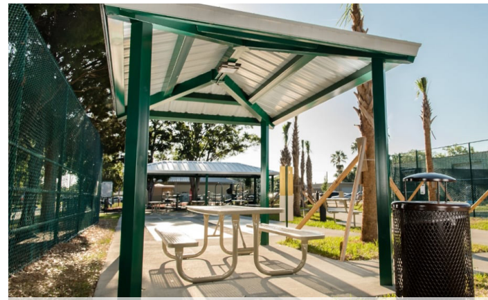
SMALL PICNIC SHELTER