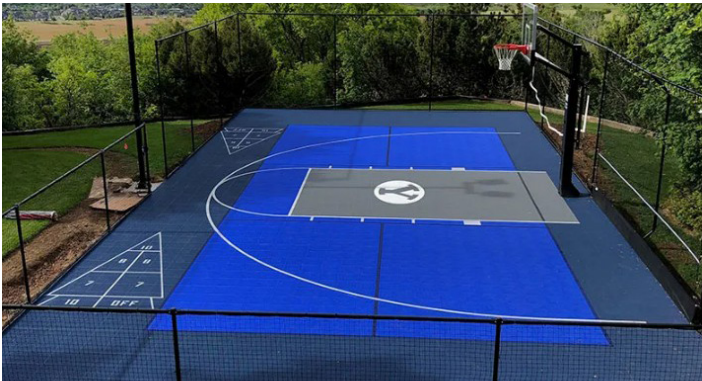
MULTI SPORTS COURT