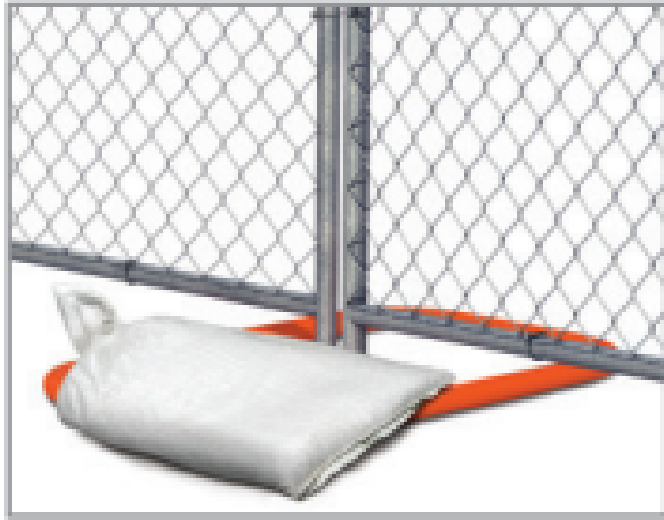
Optional Sand Bags for Extra Stability

Footings are constructed from galvanized 1-3/8" diameter tubing and welded into an approximate 16" x 36" rounded rectangles, with two smaller diameter uprights welded in place to accept the outer frame, these stands ensure stability and reliability. Each panel is further reinforced with panel clamps for even greater support.