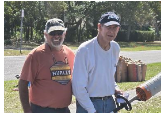
Many thanks to the gardening group for getting the church grounds ready for the spring/summer season.