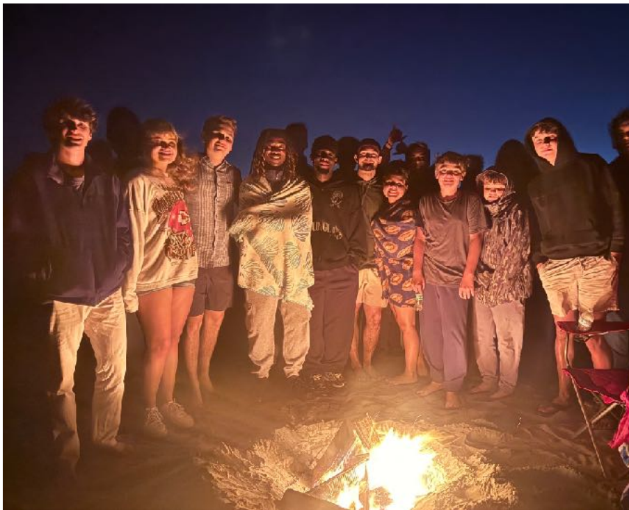
Youth Group Beach Bonfire on Sullivan's Island