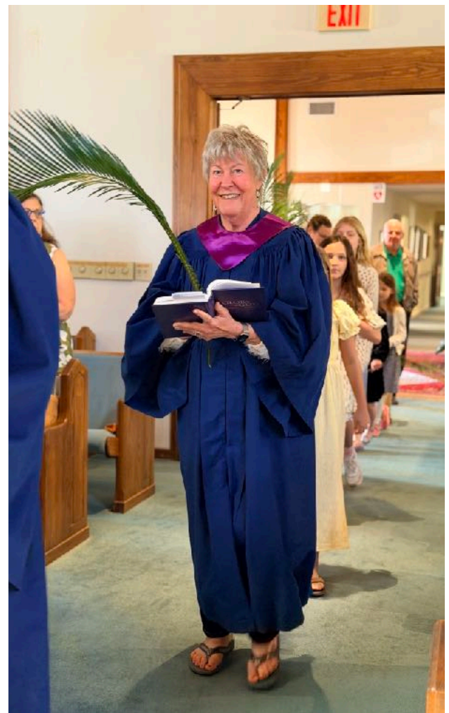
Procession of the Palms