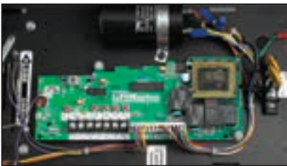
Includes the Medium-Duty Logic Board with Built-In Receiver