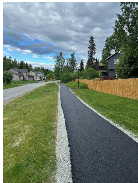
Sod will be added to finish the edges