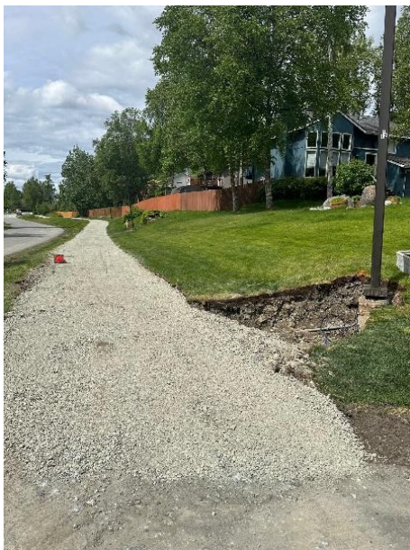
Lighting upgrades & sidewalk prep