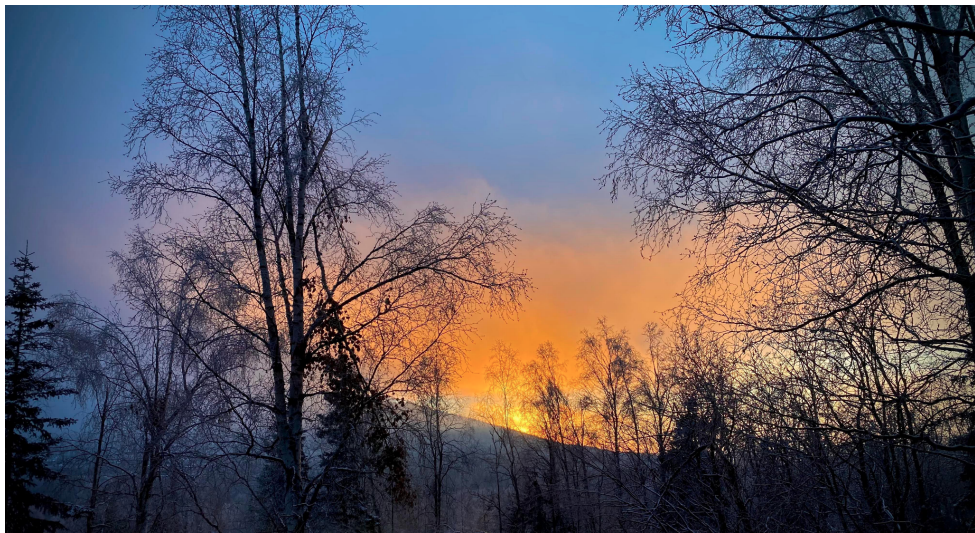
Winter sunset photo from Eaglewood.

Eaglewood HOA • 11940 Business Blvd, Eagle River, AK 99577 907.694.6942 • Eaglewoodassn.com • eaglewoodoffice@gmail.com