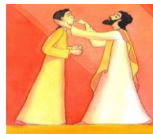
Plate Collection: £