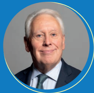
Sir Bob Neill MP for Bromley & Chislehurst Chairman, Justice Select Committee House of Common and RJ4All Patron