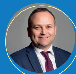
Neil Coyle MP for Bermondsey and Old Southwark