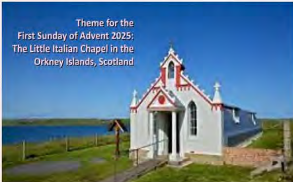
Theme for the First Sunday of Advent 2025: The Little Italian Chapel in the Orkney Islands, Scotland

2025 ADVENT REFLECTIONS WITH FR. PETE JANKOWSKI - WATCH ON YOUTUBE AT THE “BORDER TOWN PARISHES” CHAN- NEL!!! OVER 500 SUBSCRIBERS AND OVER 850 VIDEOS!!!