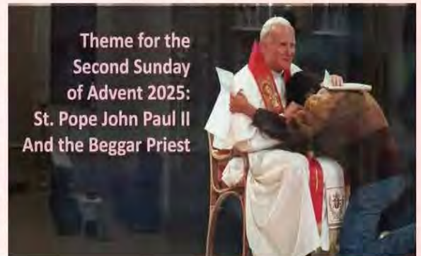
Theme for the Second Sunday of Advent 2025: St. Pope John Paul II And the Beggar Priest