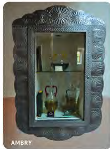
JOHAN VAN PARIJS

A repository for the oils—often marked Olea Sanctae (“Holy Oils”)—is called an ambry . It is usually in a prominent church location near the baptismal font. Each year, when the oils are replaced, a priest, sacristan, or other person may absorb the old oil with cotton and burn it in a thurible or as part of the fire that begins the Easter Vigil. With special care, old oil can also be added to a large burning candle, like the sanctuary lamp. Reverence and safety are proper for whatever method of disposal is used. ●