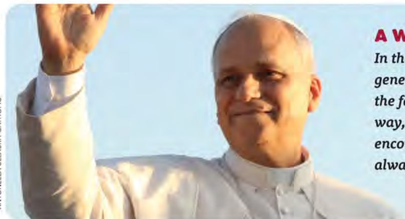
ANTONELLA ULLAURI / CATHOPIC