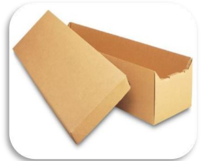
Min. Alt. Container - $75.00