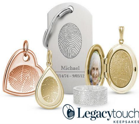
Legacy Touch – Prices Vary