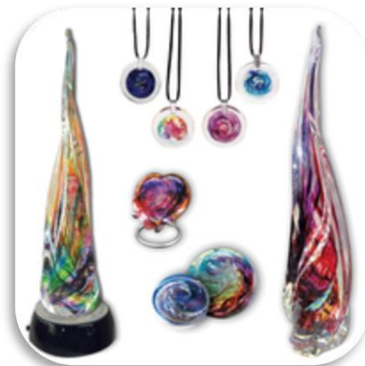
Art Glass with Cremains – from $245.00