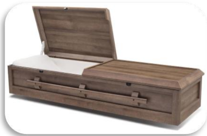
Hadley - $995.00