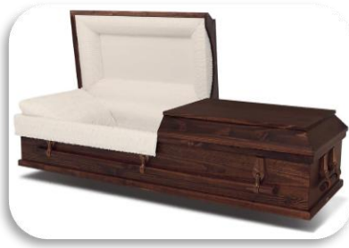
Lyra – $1595.00