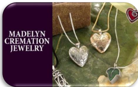
Keepsake Cremation Jewelry – from $90.00